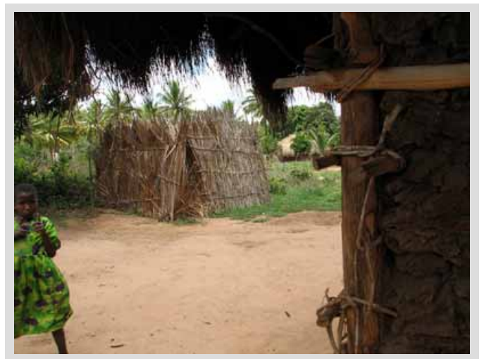
Typical outhouse of poles and grass in background offers little protection.

But the fact is that very simple technology now makes man-eating lions almost trivially easy to kill. And the word spreads fast. A few years ago, an elderly couple were sleeping in their hut one night when the wife had to go to the outhouse. She didn't come back, and the husband went out to look for her. At the outhouse, he found the upper half of her body lying on the ground. He quietly went back to their hut, fetched a box of rat poison, and came back to lace the remains of his wife. It worked.