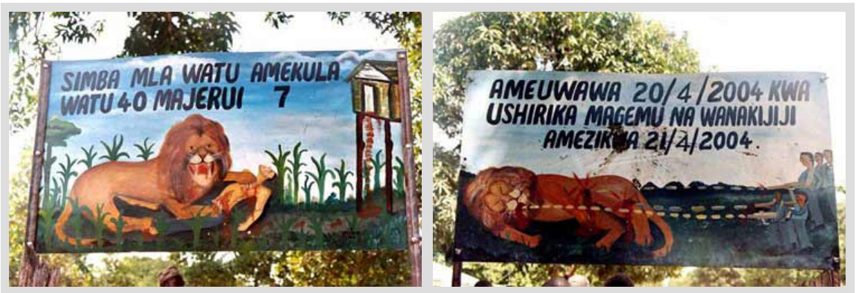
Billboards in Rufiji, Tanzania, refer to an outbreak of lion attacks from 2002 to 2004, in which forty people were killed. The outbreak ended with the death of a three-year-old male lion the villagers had come to call Osama. However, many of the reported attacks had involved a whole group of lions.

fatal, and the victims are eaten. Lions' patterns of predation on Homo sapiens are similar to those on wildebeest, zebra, or gazelle: they prefer to catch people who are away from others in the dark. Some cases are particularly horrifying: lions dig through thatched roofs and drag elderly people out of bed; they pluck small children from the breasts of their nursing mothers or the arms of their grandmothers; one woman lost her husband and parents in two separate attacks several months apart.