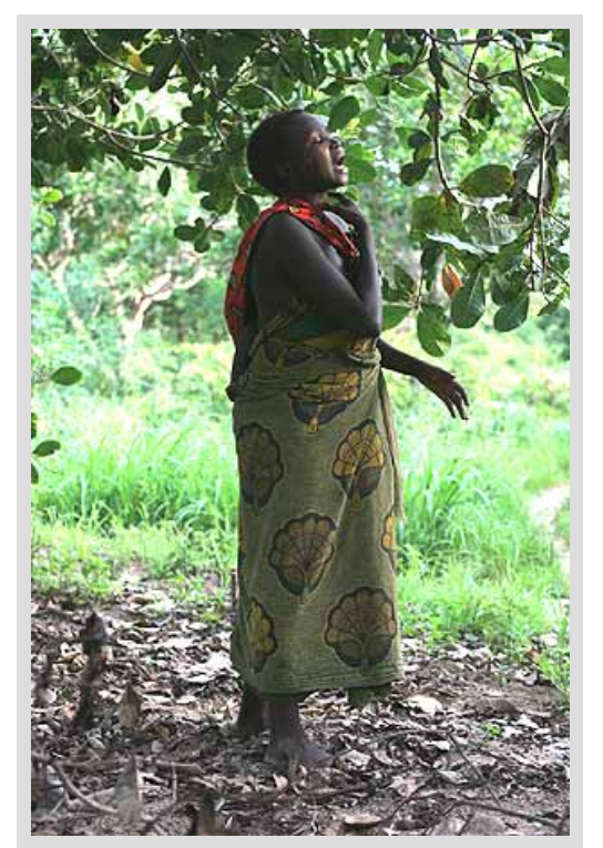
Woman explains how, one evening, her five-yearold son was grabbed from a path by a lion when she had briefly stepped aside to relieve herself. The lion dropped the boy when she gave chase, but his upper ribcage had been crushed and he died the next morning.