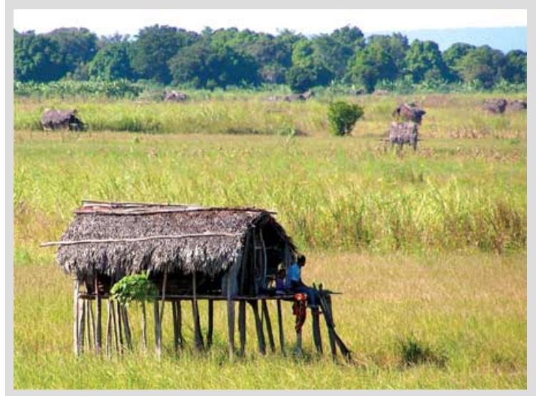
Bantu farmer oversees his field in the coastal scrublands of southern Tanzania. The makeshift hut, where he sleeps during harvest time, offers little protection from the lions that hunt at night for bushpigs—or for human prey.